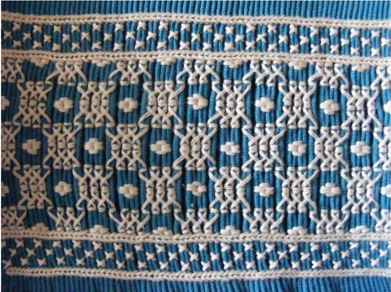
SMOCKED LACE BAND DIRECTIONS AND GRAPH by Claire Meldrum